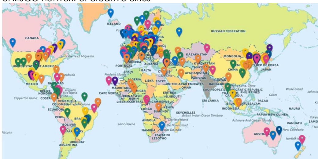
Figure 1 UNESCO network of creative cities